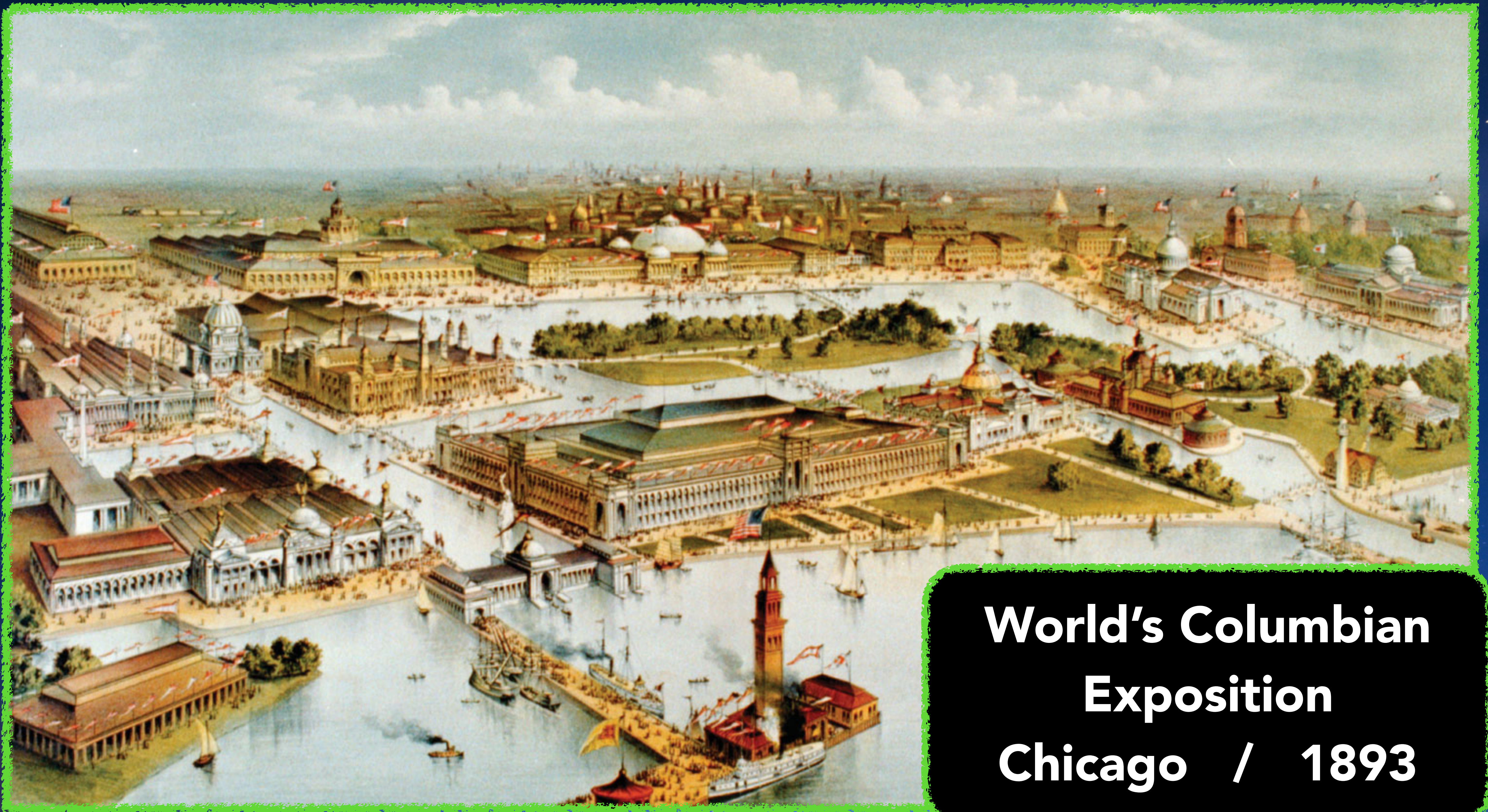
World's Columbian Exposition Chicago / 1893